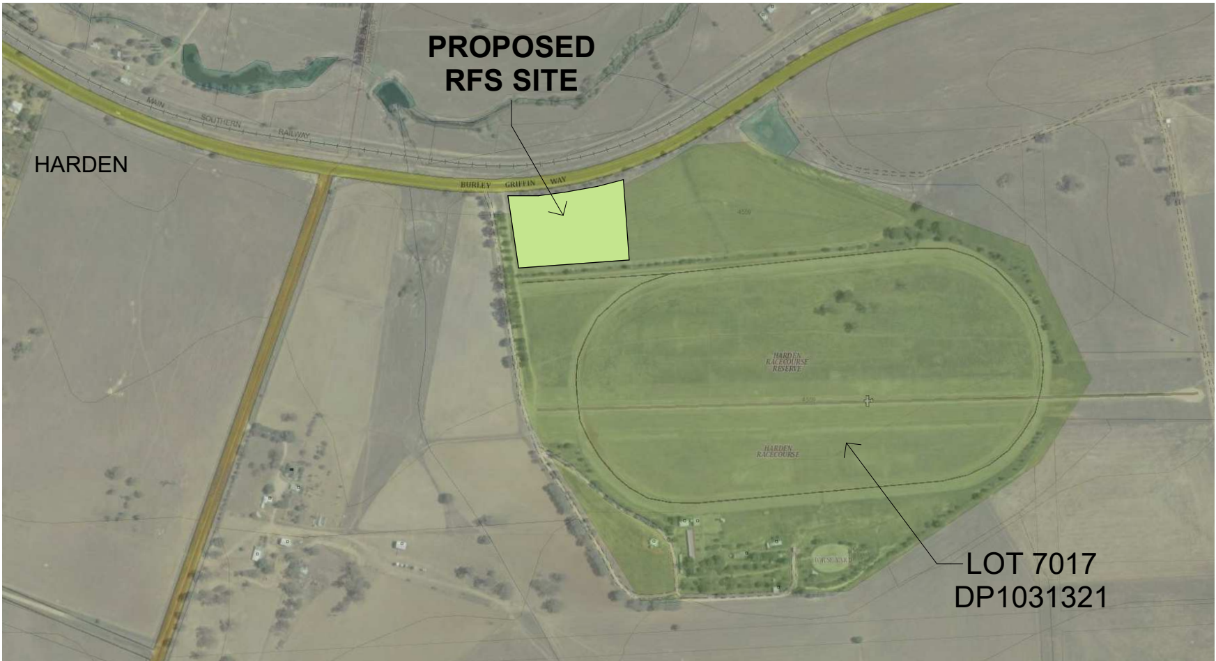
2 LOCALITY PLAN 1: 7500